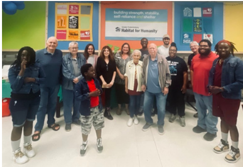
Volunteers attending the appreciation luncheon shown above.