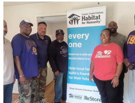
Duke Street volunteers on site.

The Duke Street, The Tao Rho Chapter of Omega Psi Phi, supported Greater Fredericksburg Habitat for Humanity during our recent service day activities at our newest rehab. Volunteers cleared, cleaned, and prepped the site for upcoming Rehab activities. Our team looks forward to getting back out to Duke and having more volunteer build site events. We will also have upcoming Davies volunteer build site events during the summer months. Stay tuned. You can always check out our events by signing in to Galaxy at: https://fredhab.galaxydigital.com/