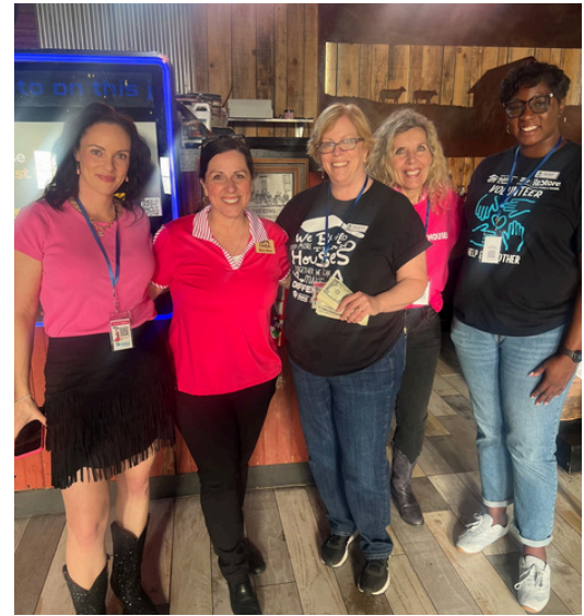
Women Build volunteers shown to the left and above .

2026 Affordable Housing Expo 10 am to 1 pm