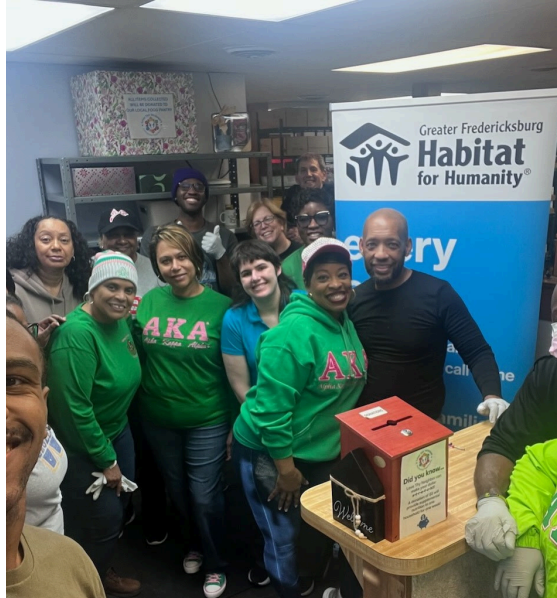
Love Thy Neighbor volunteers shown above.